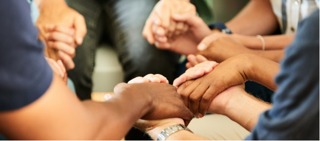
New Life Christian Church sponsors a Recovery program for people who struggle with various issues in life.

New Life Christian Church in Turlock, CA sponsors one of the largest Celebrate Recovery programs in the Central Valley, serving 70 to 85 people each week who struggle with addictions. Through weekly meetings that include gathering for dinner, worship, testimonies, and small group discussions, participants support one another in their recovery journeys. The program is for anyone who feels trapped in the struggles of life—whether it's codependency, anger, unhealthy relationships, drugs, alcohol, or anything else that has taken over their lives.