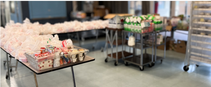
Centerville Presbyterian provides food to Afghan refugees and immigrants in the neighborhood.

Centerville Presbyterian Church in Fremont, CA is dedicated to meeting the unique needs of its community. For nearly 30 years, the church has been committed to a multi-church cooperative to provide meals to the homeless twice a week at its church campus dining center. The Fremont area has the nation's largest Afghan refugee and immigrant population, and these local churches frequently partner to serve that community, along with others in need. In August, the church served as the central hub for a backpack drive and back-to-school event for Afghan families, which involved 16 local churches coming together to donate more than a thousand backpacks to students entering the school year.