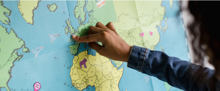
Wheaton Bible Church engages thousands of volunteers each year in support of the various ministries they support.

Wheaton Bible Church in West Chicago, IL has taken on a mission to share God's love with a growing number of people in the local community for nearly a century, while also reaching out to help more people across the globe. The church contributes 30% of its annual budget to mission work, both locally and around the world. It supports 95 missionaries and mission partners in 52 nations and contributes to its local community through participation in refugee resettlement, adoption and foster care ministries, and a local outreach ministry called Puente del Pueblo. This ministry provides after-school and summer programming for more than 150 students, case management services for families, and adult literacy programs. It also engages volunteers for about 14,000 hours each year!